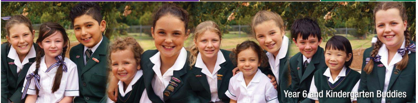
Year 6 and Kindergarten Buddies