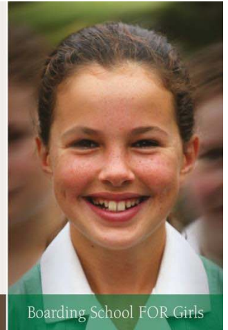
Boarding School FOR Girls

+61 2 4860 2000 . registrar@frensham.nsw.edu.au